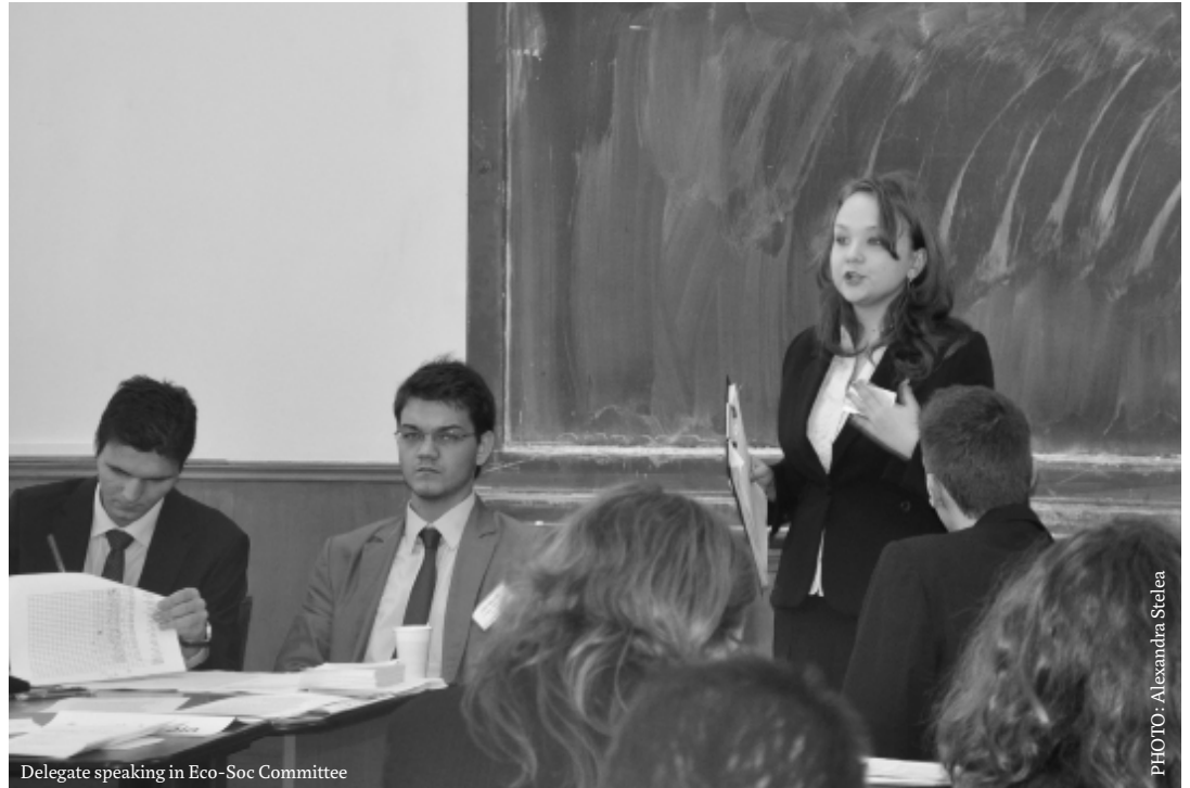
Delegate speaking in Eco-Soc Committee