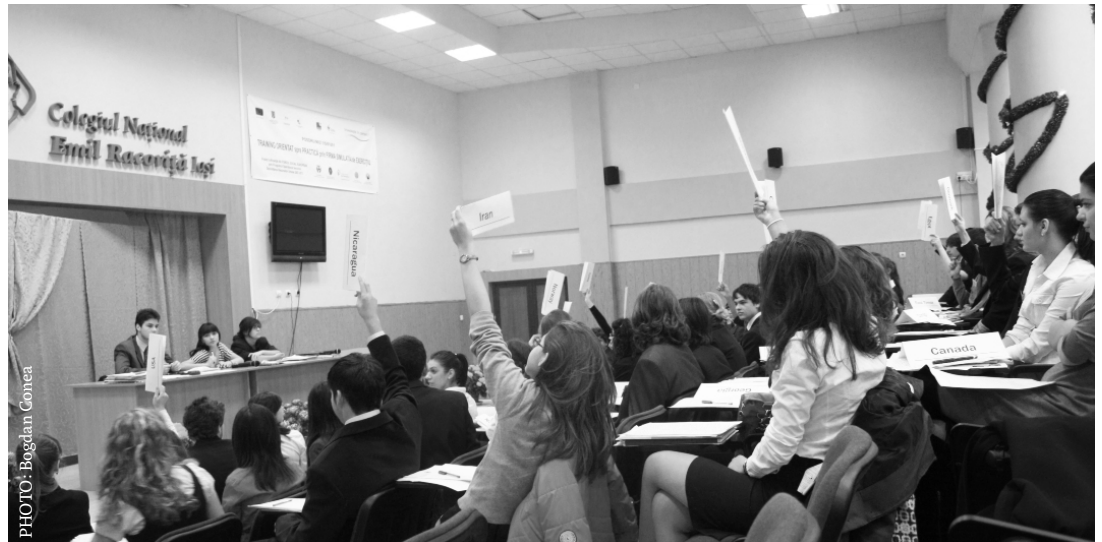
Delegates of the Human Right committee voting

As the Universal Declaration of Human Rights states, “Men and women of full age are entitled to equal rights as to marriage, during marriage and at its dissolution. Marriage shall be entered into only with the free and full consent of the intending parties”. But still, as in Egypt’s case, child marriages cannot be forbidden, due the fact that every year it provides the country’s budget almost 8 billion dollars.