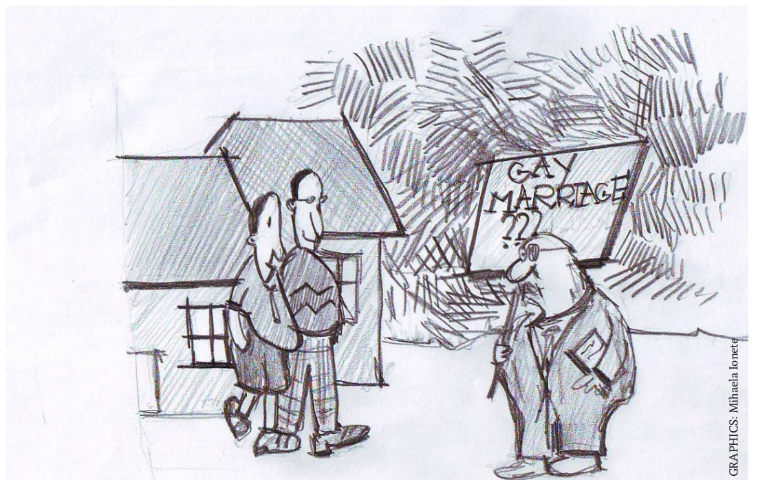
GRAPHICS: Mihaela Ionete

even the freedom of expression stated in the Declaration of Human Rights, isn’t anymore taken for granted. So what do that people need? How can they be integrated into social life? What do they need? Well, it can be simple - social acceptance.