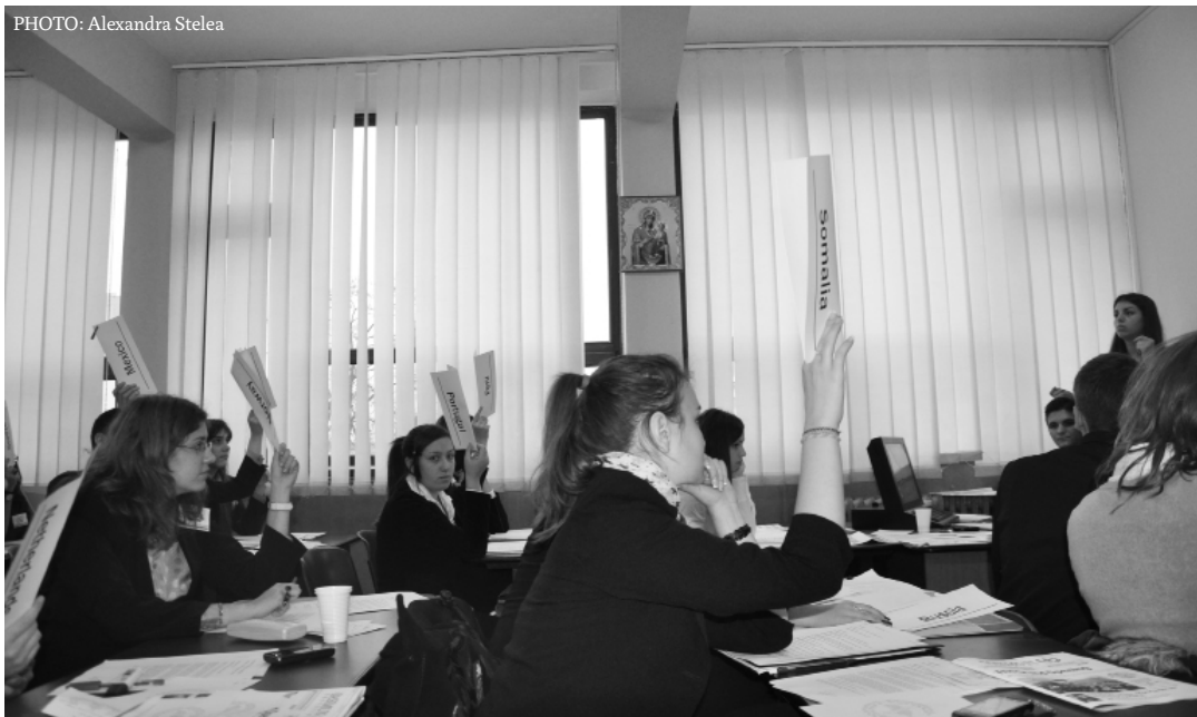
Delegates of the Eco-Soc Committee voting