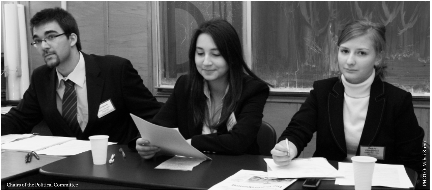
Chairs of the Political Committee