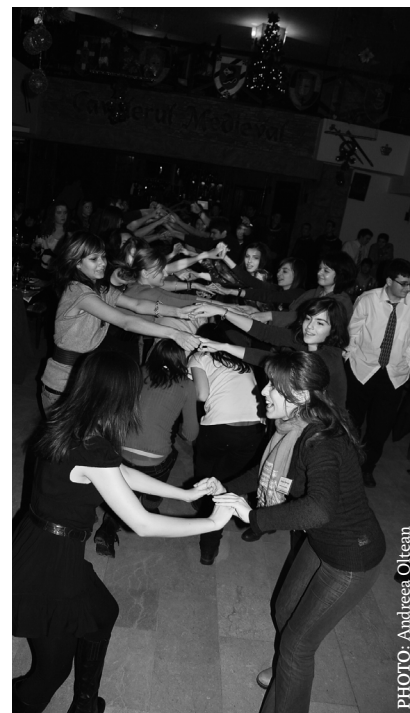
Delegates having fun at Cavalerul Medieval